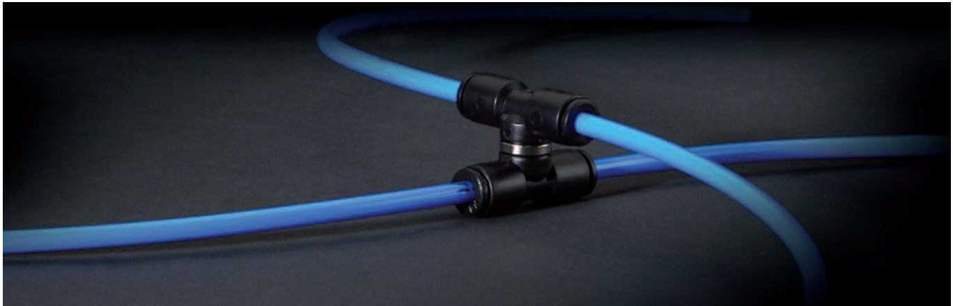
Parallel stud, male اتصال مستقیم